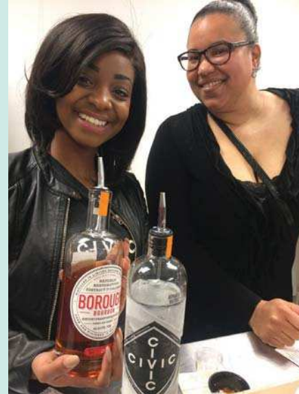
Republic Restoratives, a woman- (actually two) owned distillery in DC is already batting it outta the park.